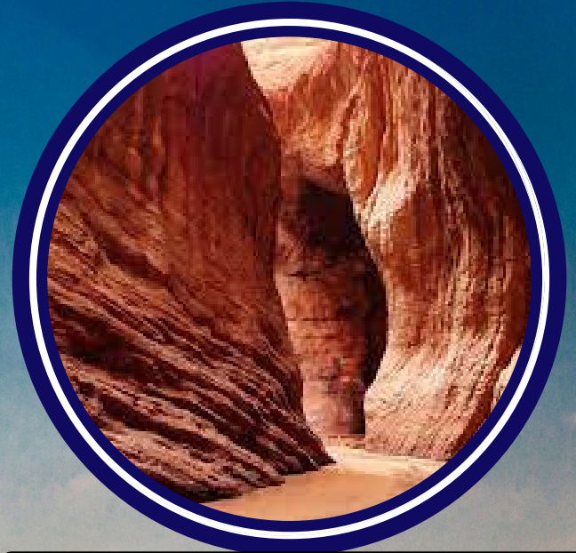
Mysterious Grand Canyon of Tianshan