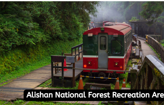
Alishan National Forest Recreation Area