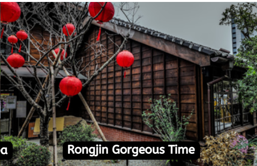
Rongjin Gorgeous Time