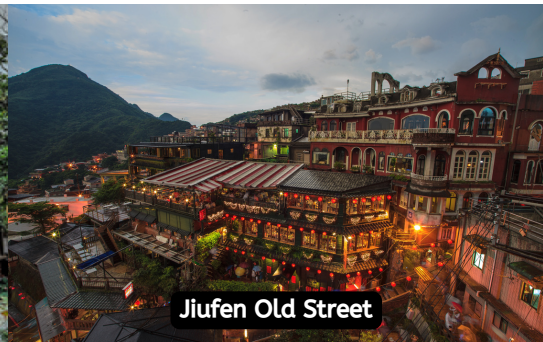
Jiufen Old Street