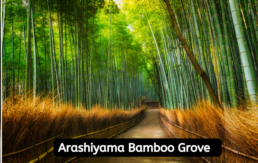
Arashiyama Bamboo Grove