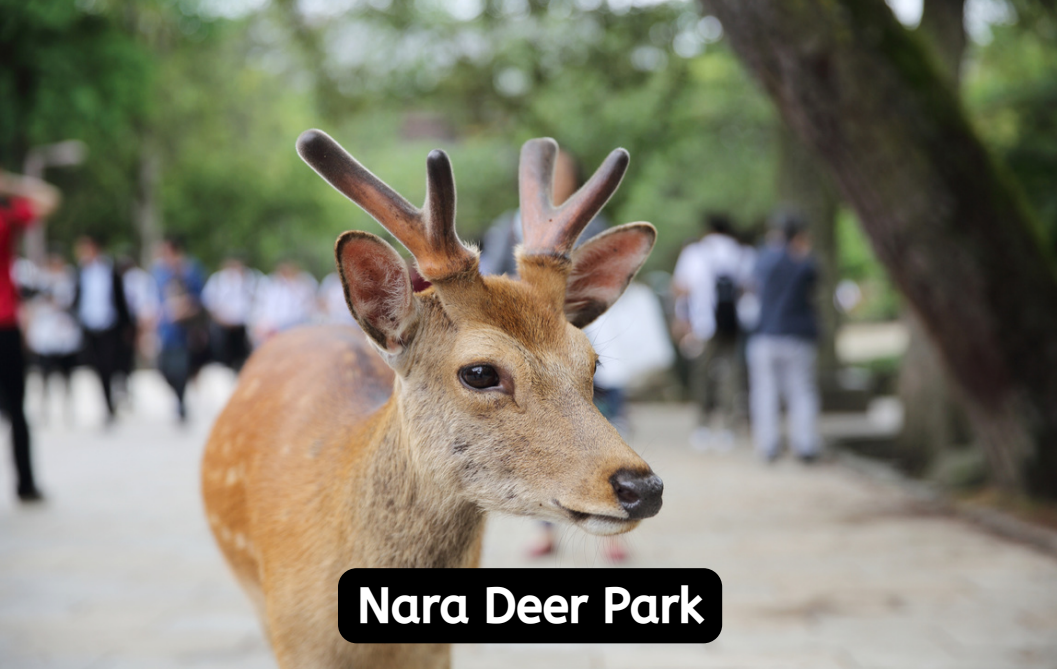
Nara Deer Park