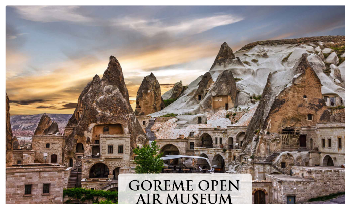
GOREME OPEN AIR MUSEUM