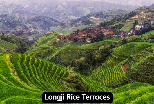
Longji Rice Terraces