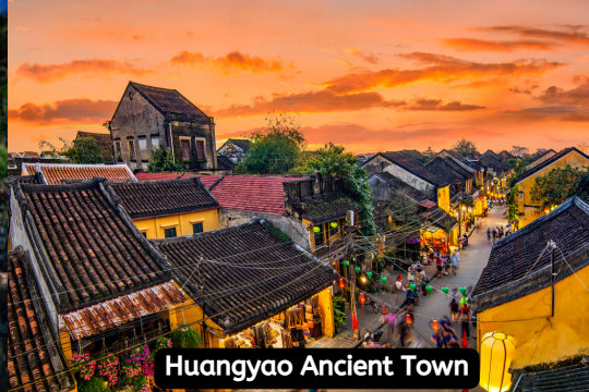
Huangyao Ancient Town